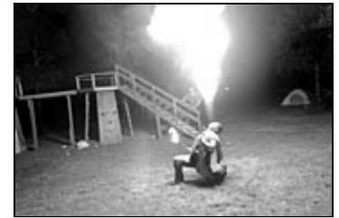
Iggy sheds some light on Naughtyham.