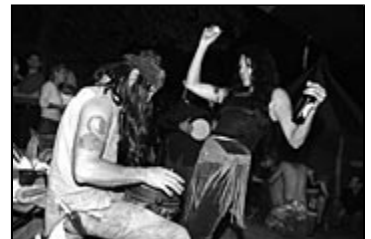
Beer, bongos and belly dancing are Rennie staples.