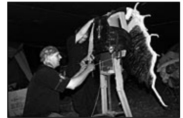
Charles and Robin White put the wings up for the night.